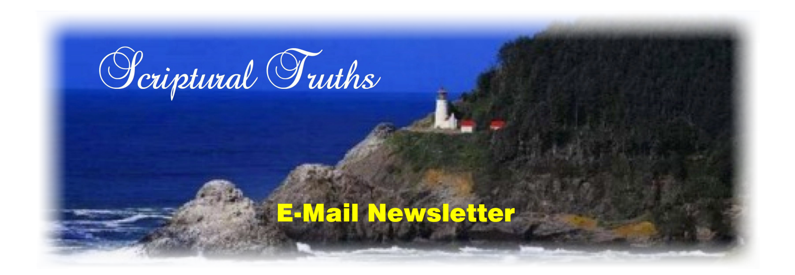
The Lord May Come ... Perhaps Today ... Behold, I Come Quickly ... Rev. 22:7