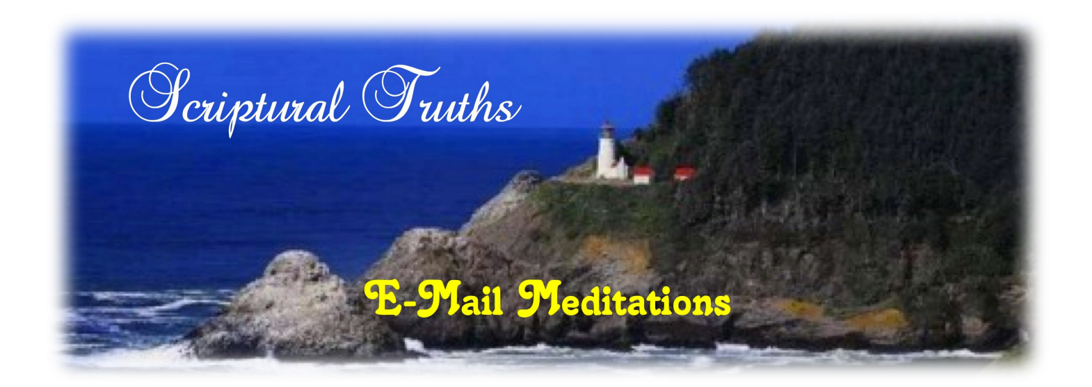
The Lord Will Come ... Perhaps Today ... Behold, I Come Quickly ... Rev. 22:7